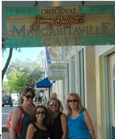
The Dream Team in Paradise

Wash your hands frequently, use disinfectant wipes. There's much more about this on our blog. Be sure to visit it.